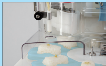
2nd forming (wasabi for option)