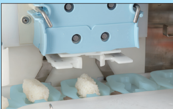
Rice dividing and 1st forming