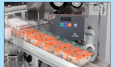
Wrapped sushi comes out automatically.